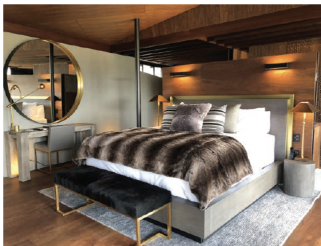
A suite at The Lindis