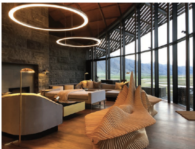
An interior of the Lindis