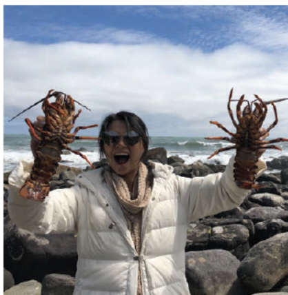
Crayfish for lunch

If you want to find out more about the unforgettable experiences to be had in New Zealand do get in touch with Singapore based luxury agency Sonnenkind, who is happy to curate a dream trip just for you.