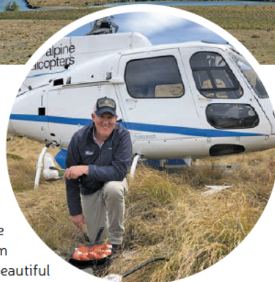
A unique lunch experience via heli

in so many ways. Is it the unique setting away from civilisation in the most beautiful scenery? Is it the five designer suites and the stunning mirror pods that invite you to forget any stress you ever had? Is it the unparalleled wine cellar? The high country New Zealand hospitality? Or the impressive stargazing you can do whilst relaxing in your hot bubble bath once the sun has set over the surrounding mountain peaks? The Lindis clearly is a place where the quiet of nature becomes amplified and where connecting to the land seems to happen simply by default. I feel totally at home and at ease in this unique place and can see why the distinct travellers from around the world have fallen in love with this new designer luxury lodge.