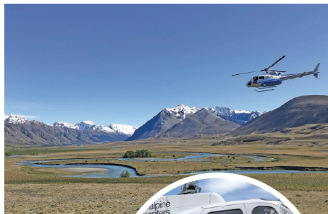
Arrival at Lindis via Heli

Rather than going back to Queenstown Dan takes us to yet another very special place – the newly opened superlodge The Lindis – an iconic and architecturally distinct luxury lodge located in the pristine Ahuriri Valley. It is hard to describe what makes The Lindis so special as it is appealing